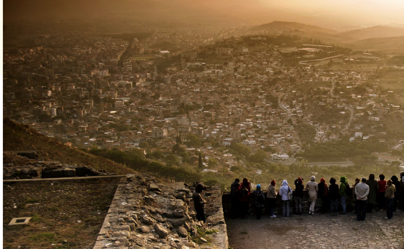
@RURITAGE photocontest – Serkan Çolak