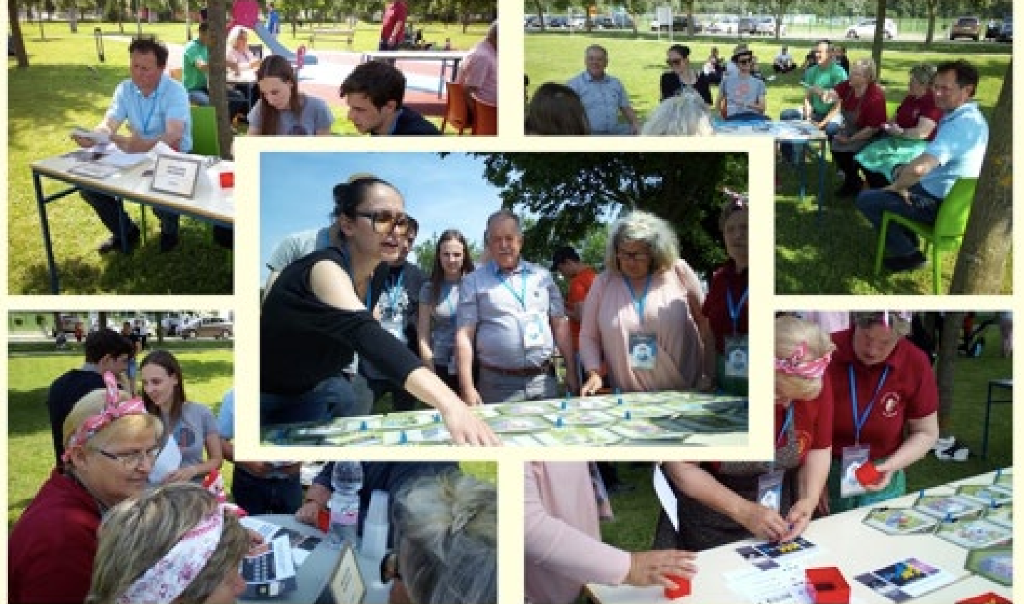
@RURITAGE Ruritania serious game