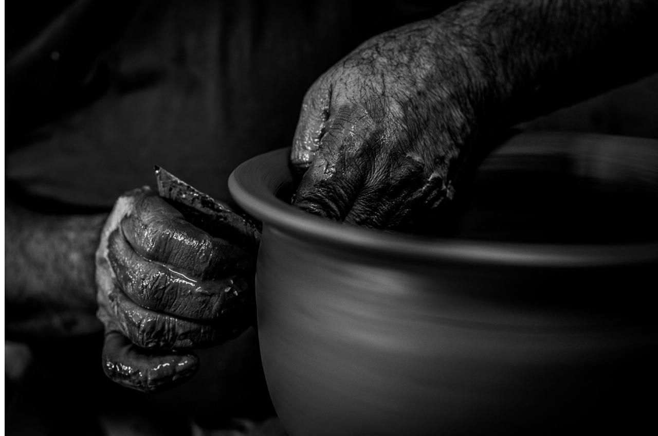
@RURITAGE photocontest – credits Efstratios Kapetanas