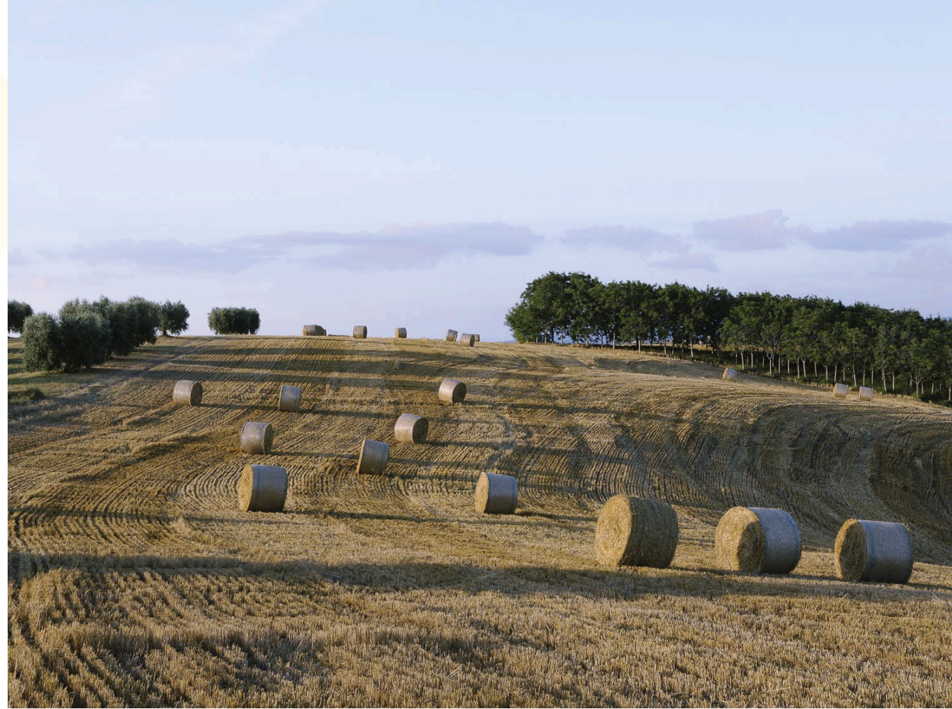
@RURITAGE photocontest