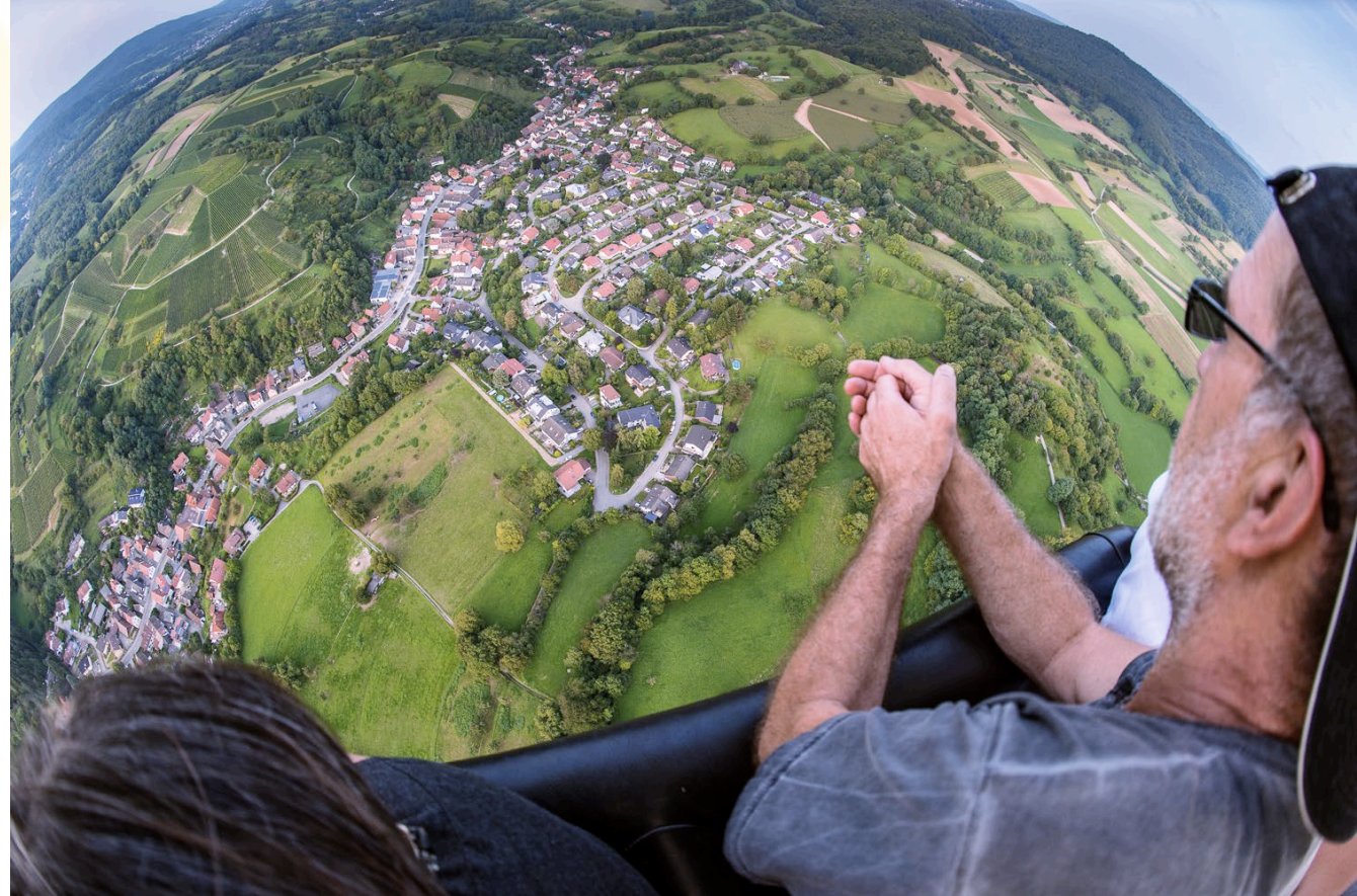
@RURITAGE photocontest – credits Doerwald Bernd

Supporting local resources / Integrating new skills and abilities