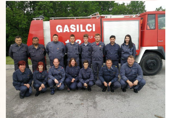
Service to my rural community