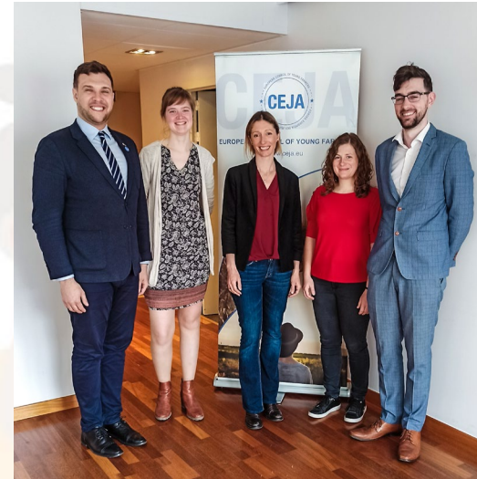
My role as Vice President of the European Council of Young Farmers (CEJA)