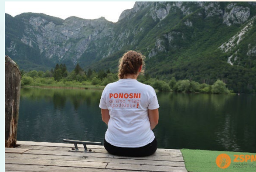
My commitment with Slovenian Rural Youth ZSPM