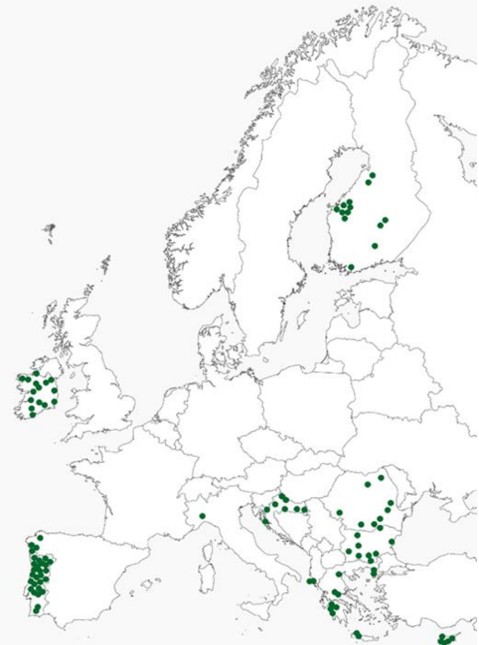
Learning from the Extremes 123 selected schools